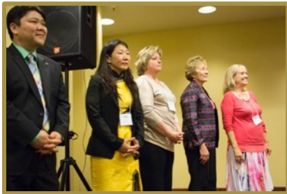
1995 Mongolia Prayer Walking Team