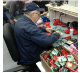
Emergency radio assembly

When Hurricane Maria made landfall on September 20 th , it caused significant damage to the radio network, and radio broadcasting was down for an extended time. At WBMJ, the satellite dish was dislodged and rendered inoperable, and the tower for WIVV in Vieques was toppled. The Fellowship of Christian Farmers, in the United States was able to rush two generators to Rock Radio's WBMJ which enabled them to be back ON AIR preaching the word of God. Galcom rushed 200 GO-TELL AM radios in October and will be sending another 400 soon- 200 for each station. Praise the Lord for His faithfulness through the body of Christ.