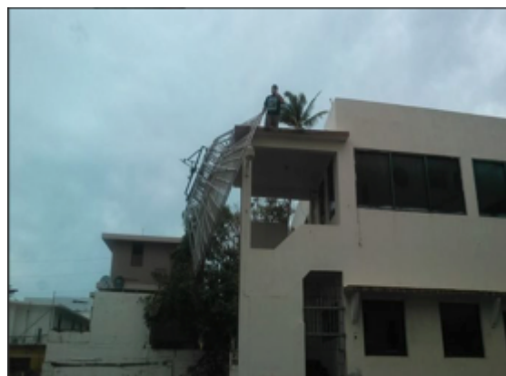
WBMJ in San Juan

Galcom has enjoyed a cooperative ministry relationship with The Rock Radio Network for many years. We've provided solar powered GO-YE Radios set to frequencies for WBMJ, WCGB, WIVV . These three stations, located in different regions throughout Puerto Rico, comprise The Rock Radio Network that broadcasts Gospel-centered music and Bible teaching . We are very grateful that the dedicated team at the Rock Radio network remains committed to serve hurting Puerto Ricans who lost much due to the storm's fury and that many of those previously supplied durable radios are very likely still working there.