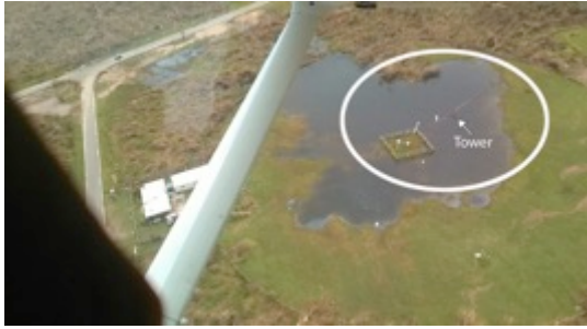
WIVV's collapsed tower on Vieques