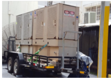
Generators for WBMJ